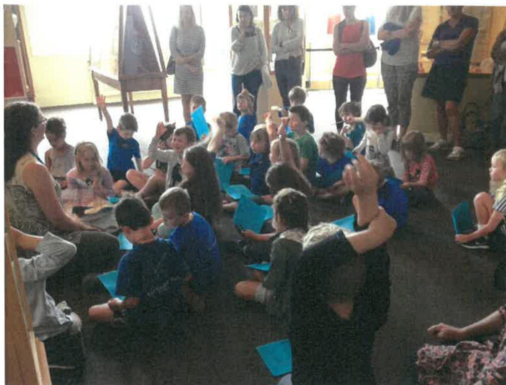
Rata Class Trip to Otago Museum last week