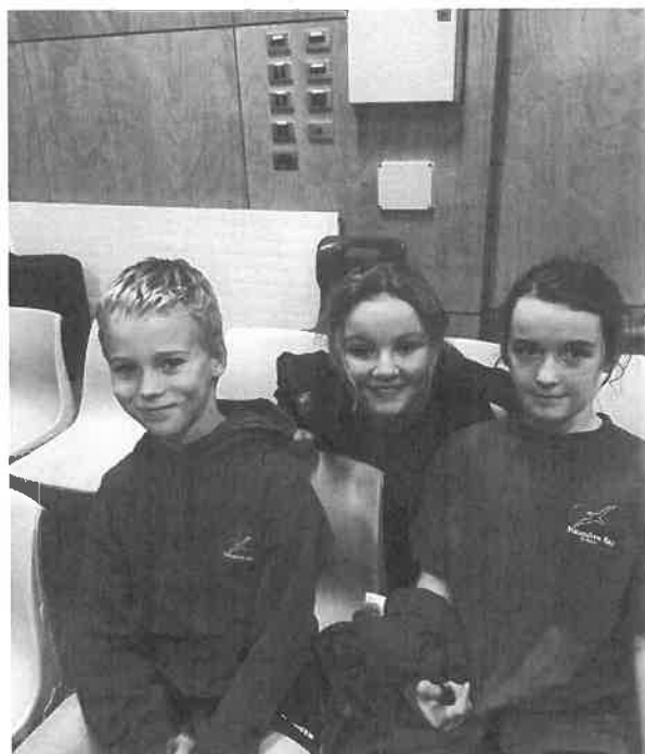
Macandrew Bay One looking exhausted after a full two hours spelling Quiz!