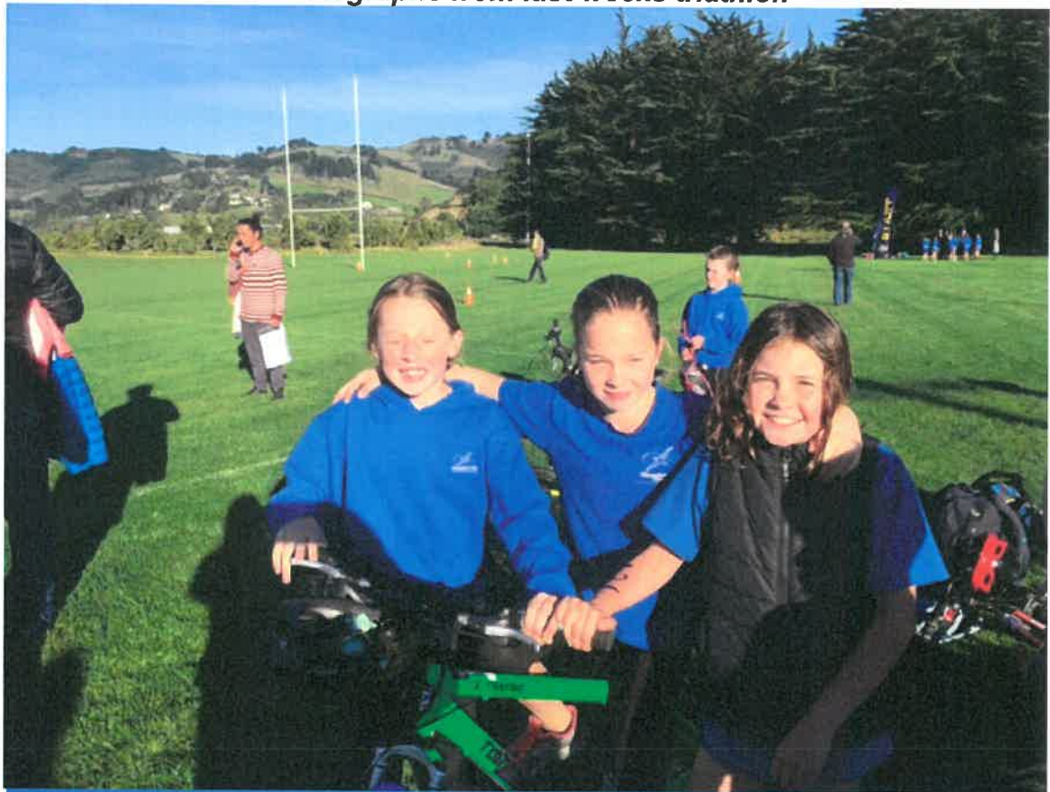
Photographs from last weeks triathlon