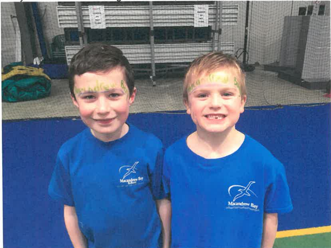
The netball twins from the Macandrew Bay Seals team