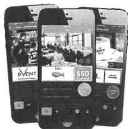
The Entertainment TM Digital Membership