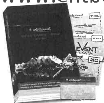
The Entertainment TM Book