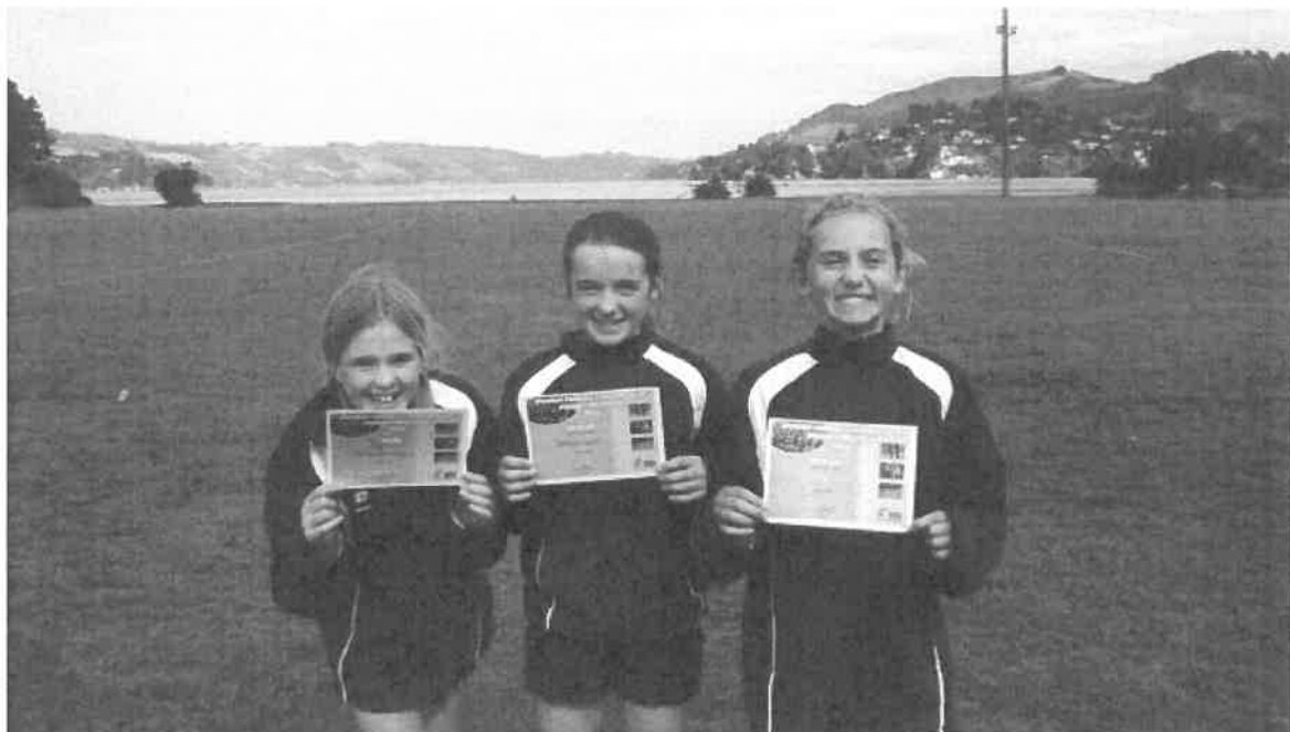
The other team won their division of Years 6 girls. Well done to both teams!!!