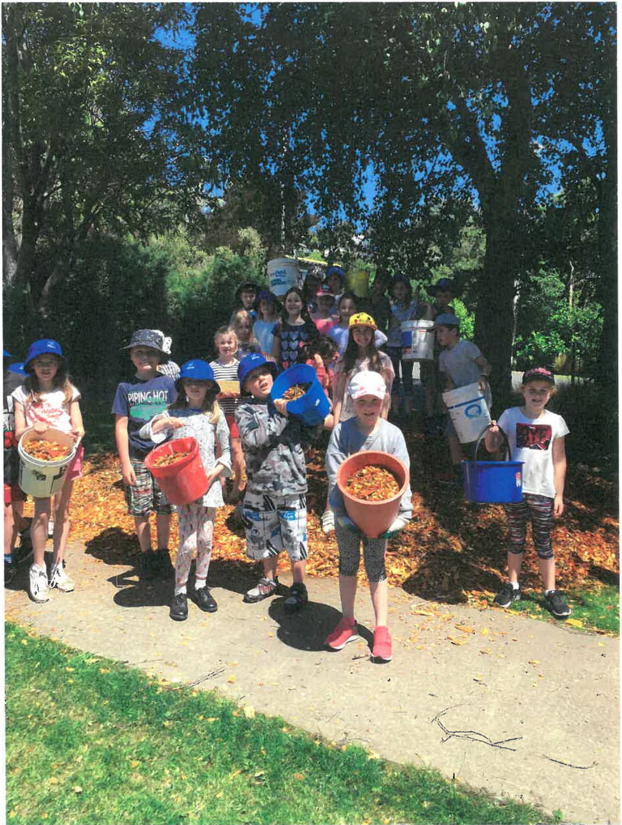
Our keen woodchip helpers on Tuesday lunchtime! All hands to the pump shifted heaps of woodchips in no time and the Year 6 children were great organisers over at the stream too