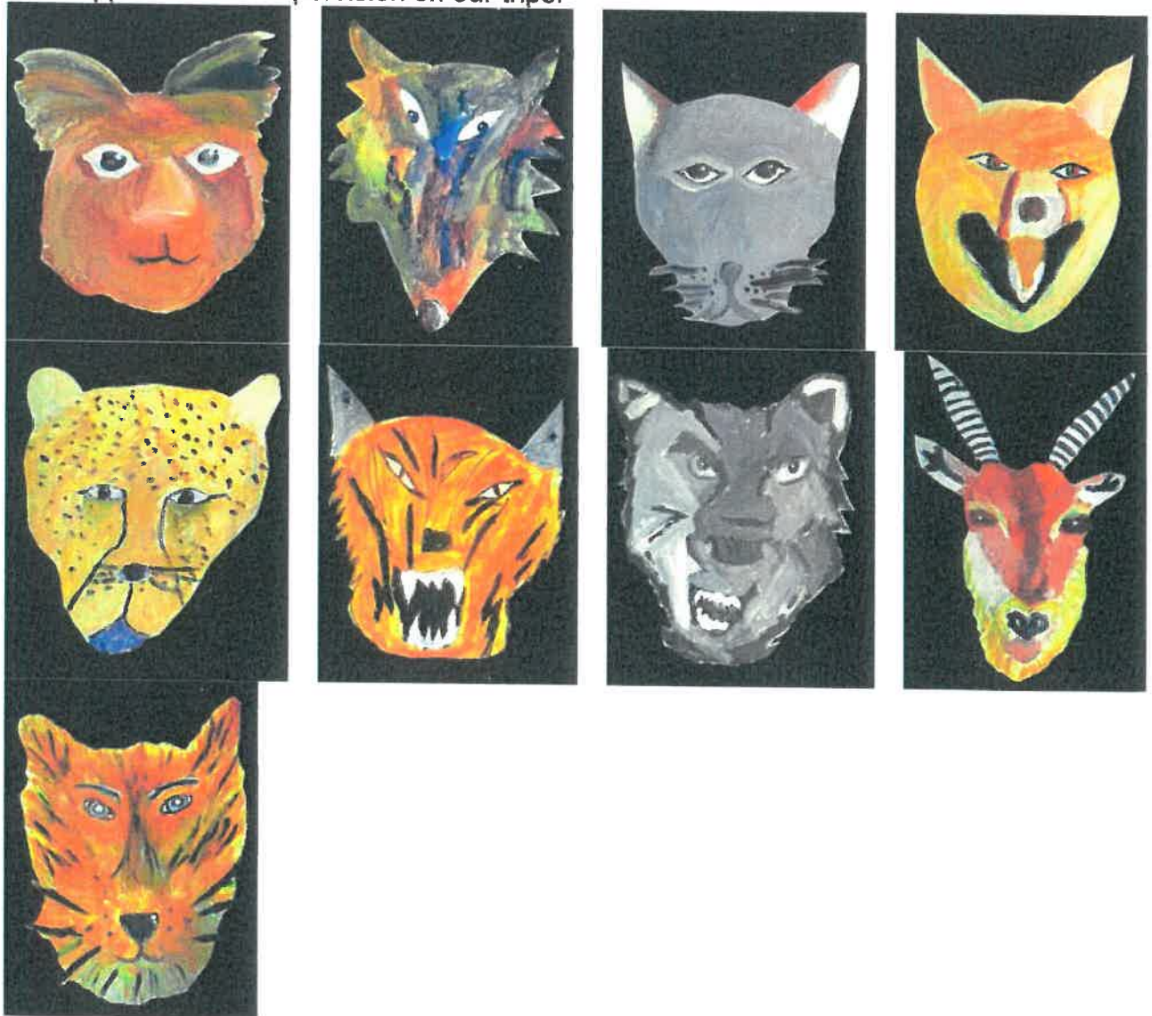
A few of the fabulous masks made by Toroa class last week at the Art Gallery